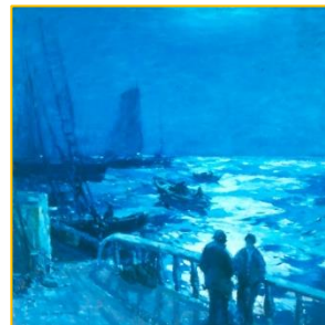
"Night on the Banks" shows different values of one color and may have a choppy texture .