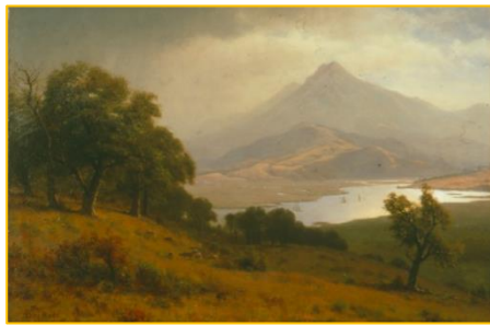
"Mt. Tamalpais" has forms in the front and back of the image.