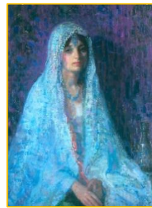
"Rose of Shiraz" uses bright vibrant color to contrast the emotion she shows.